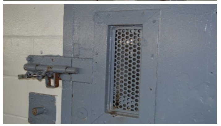
Engaged padlocks on restrictive housing unit cell doors in a close- security GDC prison in 2022. An officer at this prison later told DOJ that padlocks are not used on cell doors at this prison.

sometimes of the housing units. According to staff at another prison, doors in the medical unit, including doors that lead to the administrative offices, have not had working locks for at least 17 years, and incarcerated people walk into the staff breakroom and steal food from the refrigerator on a regular basis. During site visits, DOJ experts repeatedly observed malfunctioning lock indicator lights, padlocked doors, and improperly secured areas.