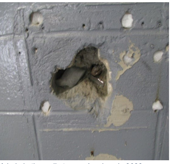
A hole in the wall at a men's prison in 2023.

GDC's internal facility audits, as well as information DOJ obtained from facility site inspections and interviews with staff and incarcerated people, establish that GDC does not take the steps necessary to maintain secure prisons, including timely preventive and corrective maintenance. Problems with lock functionality are documented in GDC's internal audits of multiple prisons. Leadership has acknowledged that aging facilities raise challenges across the system, with the average GDC prison over 30 years old and reaching "end of life," according to a recent public presentation by the Commissioner.