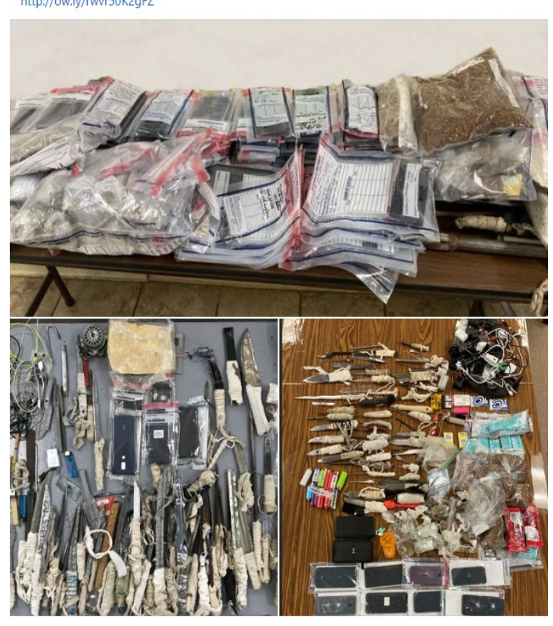
Photographs posted on Facebook by GDC showing contraband including weapons, drugs, and electronics recovered in GDC shakedowns in 2022.

More than 1,000 Contraband items seized at Multiple State Prisons: Full Facility Shakedowns Conducted http://ow.ly/rwvr50K2gFZ