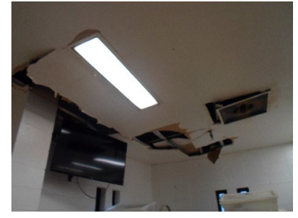
Holes in ceilings in areas accessible to incarcerated persons at a large GDC men's prison in 2022. GDC acknowledged that some holes DOJ observed at this facility were caused by "inmate vandalism."