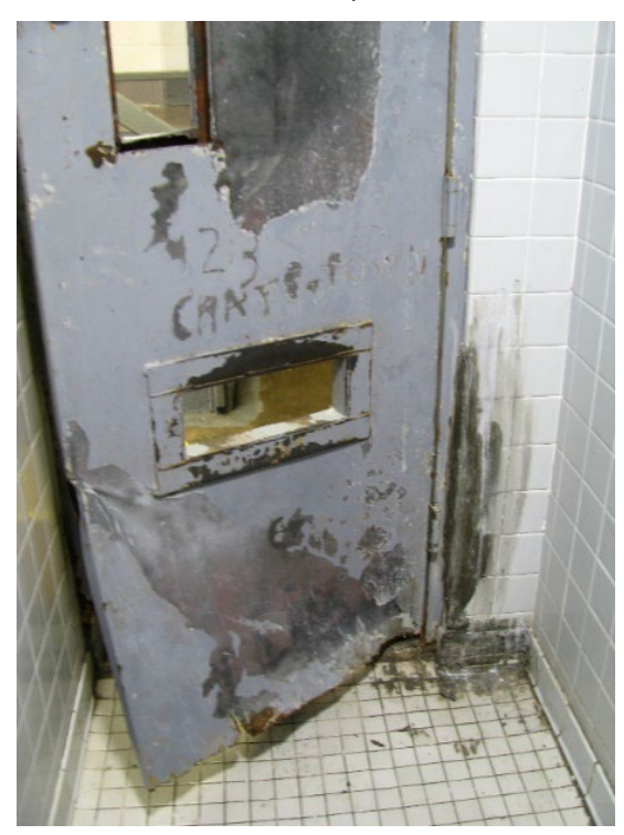
Damaged shower door in a housing unit at a GDC men's prison in 2023.